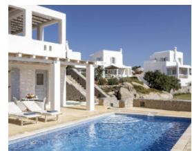
Hotel Review: The Naxian Collection, Naxos In Greece