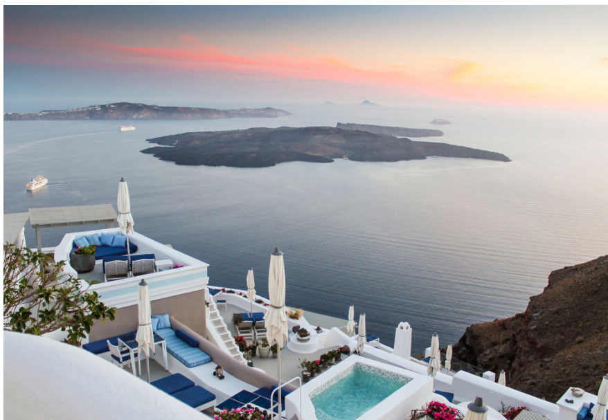
The hotel is ideally placed to take in the famous sunsets of Santorini

Although Imerovigli is a quieter spot, you don't feel withdrawn from the action. There are a good number of restaurants and shops in the immediate vicinity, and you are only a five-minute taxi from the bustling Fira. It's 20 mins to the picture-perfect (but borderline claustrophobic) Oia, and the international airport and main ferry port are a comparable distance. Transfer services are available from the hotel.