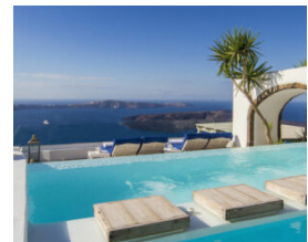
Hotel Review: Iconic Santorini, Imerovigli, Santorini In Greece