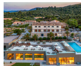
Win A Luxury Hotel Stay At The Five-Star Carrossa Hotel, Spa & Villas In Mallorca

TAGS: boutique hotel Europe greece greek island hotel review Iconic Santorini luxury hotel luxury travel Santorini