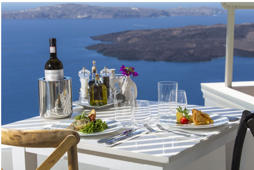
Hotel facilities include a restaurant with views across the Aegean Sea