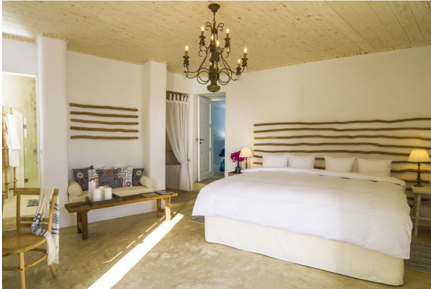
Rooms and suites have a traditional Greek décor, homely but refined

There are 19 rooms and suites, tiered across six levels descending down the sheer cliff face. Each comes with a personal veranda with envy-inducing scenic views, and most have their own private or shared plunge pool for a necessary cool-off during a day of sunbathing. Iconic Santorini characterises itself as a ‘boutique cave hotel’ and indeed many of the rooms are partially underground, burrowed into the rock. Upon opening the doors though, there’s a surprisingly generous amount of space (a bit like entering the Tardis): the rooms are enclosed but not dingy or dark; a good amount of natural light still floods through to the whitewashed walls within.