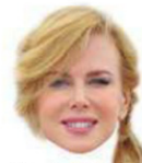
Nicole Kidman Patmos